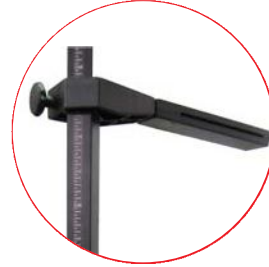
Manual alignment visor