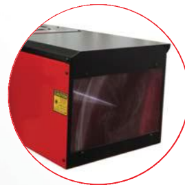
Central laser pointer for easy positioning of the unit